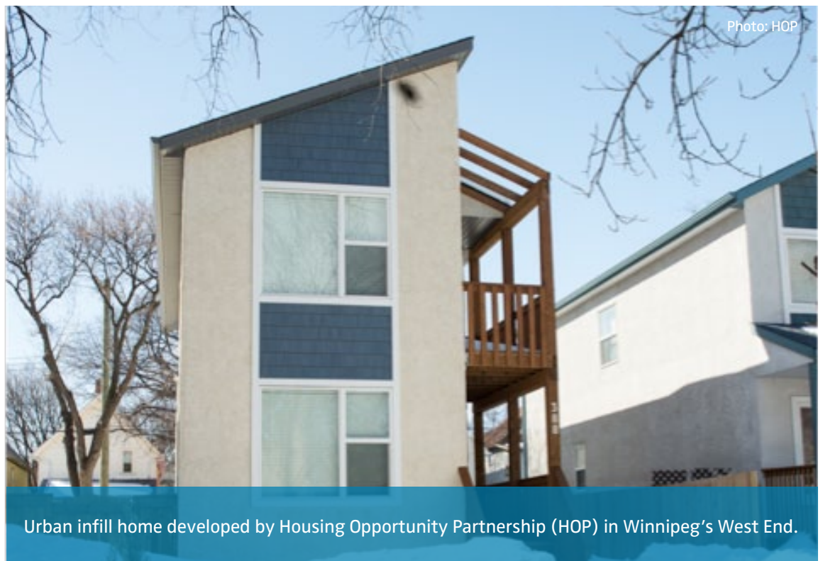
Urban infill home developed by Housing Opportunity Partnership (HOP) in Winnipeg's West End.