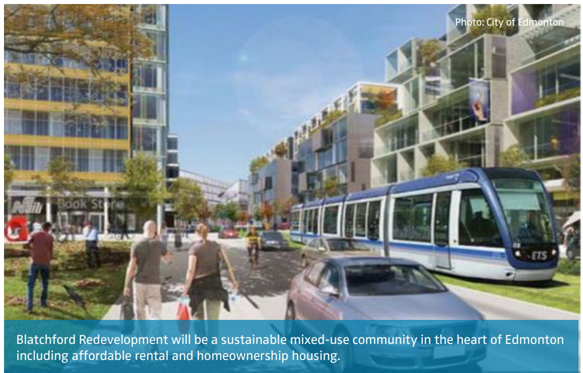
Blatchford Redevelopment will be a sustainable mixed-use community in the heart of Edmonton including affordable rental and homeownership housing.

It is not just sustainability or innovative design however that sets the Blatchford Redevelopment apart. It is also the integration of new and existing infrastructure that capitalizes on the principle of sustainable urban renewal, simultaneously reinvesting in current neighborhoods through the repurposing and reuse of inner city public lands.